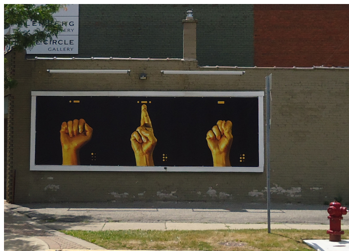
Vagner Whitehead, gold code:ART , installation view

Vagner Whitehead participated in The Public Art Project in the Detroit Metro area with his billboard, installed in July, call "gold code:ART." The piece received media coverage and a video documenting its installation is posted on the internet: http://www.youtube.com/watch?v=UpKzokCnU94